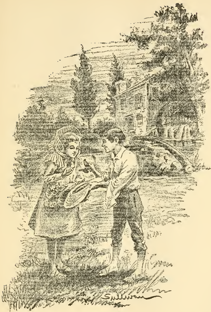
"While chasing butterfly or bee"